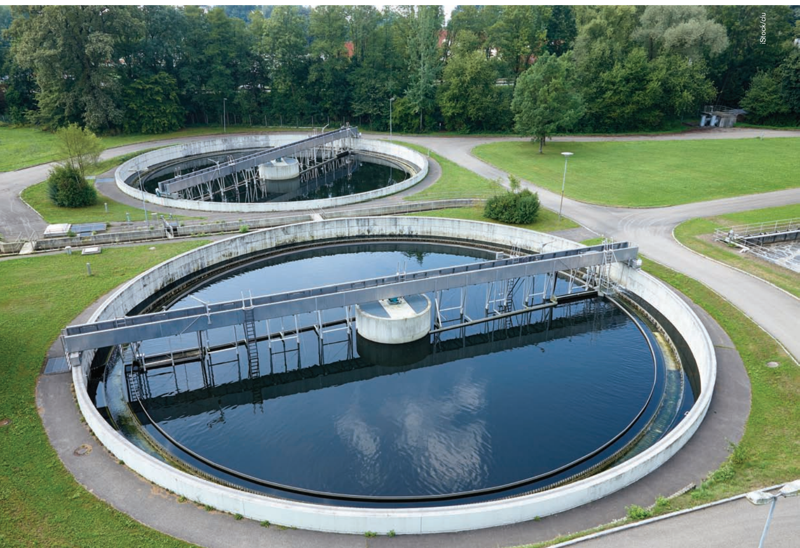
Only 20% of Colombia's urban watersheds are regulated, and regulatory oversight of treatment and transport facilities is lacking.

Existing hydrologic data and monitoring systems are inadequate to sup-