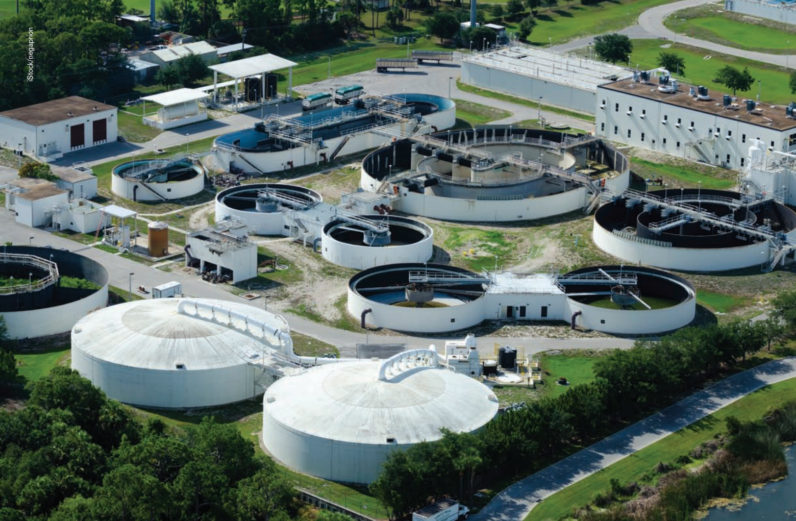
Effective regulation of private urban water purveyors in Chile has prevented monopolization and resulted in fair pricing.

poses a threat to existing patterns of water supply and sanitation management. A national adaptation agenda needs to be assembled and adopted if current patterns of management are to be preserved. 2