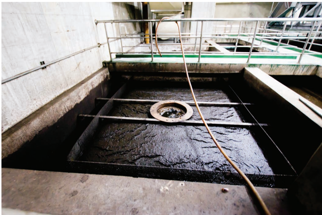
Water supply and sanitation infrastructure in the United States is outdated, and there has been little effort to date to modernize and renew it.

Rationing is commonly used in areas with extreme scarcity where restricted availability of water tends to be short-